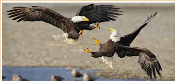
W I L D L I F E