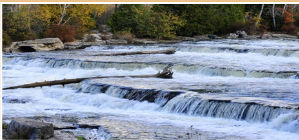
R E C R E A T I O N